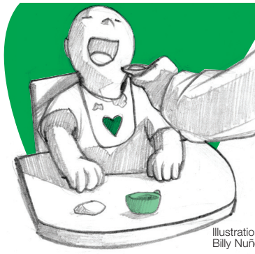
Illustration by Billy Nuñez, age 16